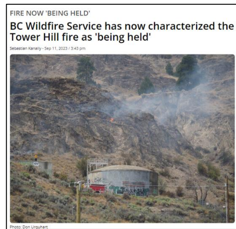
Figure 2. Screenshot of a Castanet article about the Tower Hill/Oliver Mountain wildfire in September 2023